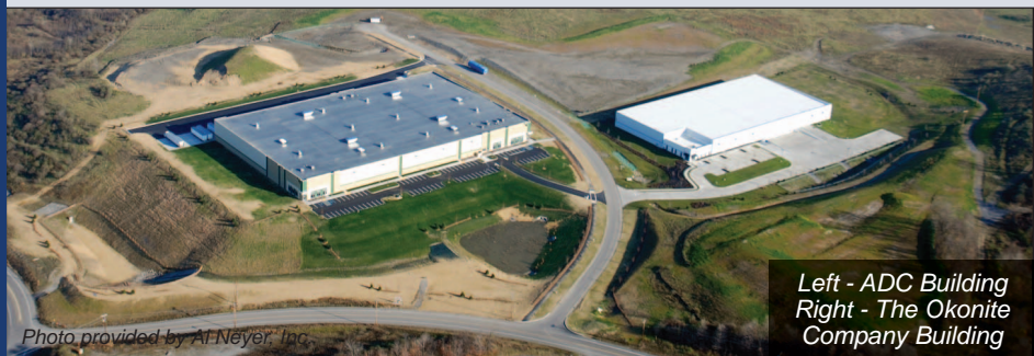
Left - ADC Building Right - The Okonite Company Building