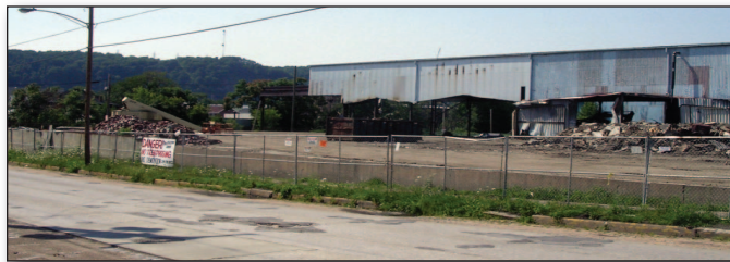
Above: Site pre-demolition / Below: Phase I complete

The development is unique for its site configuration, which was dictated by Homeland Security design requirements. Criteria included the need to provide a secure facility while implementing an environmentally-sensitive design that addressed the latest Stormwater Best Management Practices.